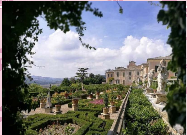
Le Marche, Italy-2024